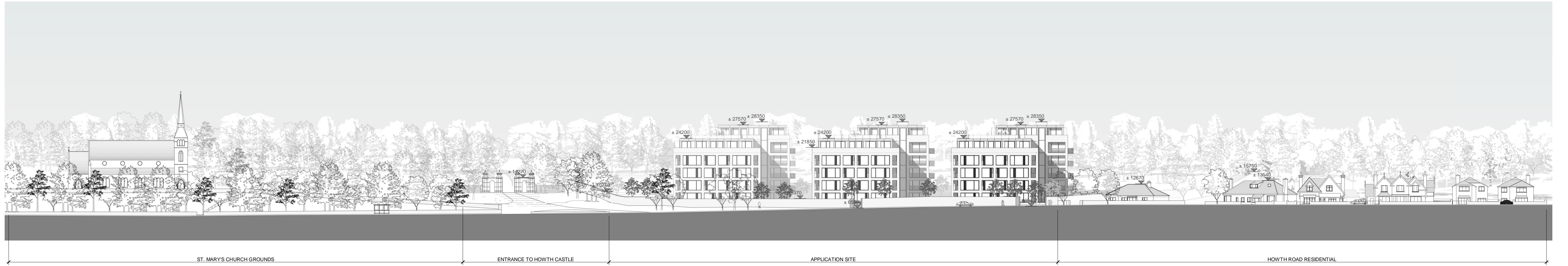
1 Contiguous Elevation - North 1 - Stepped scale 1 : 500