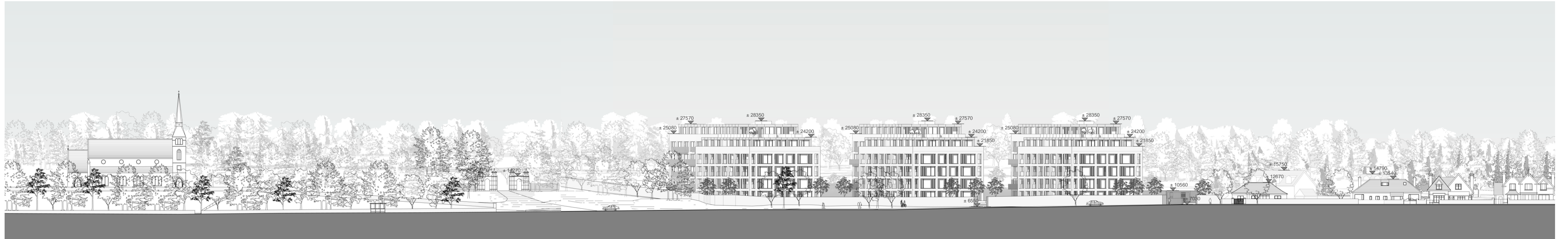
2 Contiguous Elevation - North 2 - Cranked scale 1 : 500